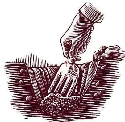
MIX INTO SOIL