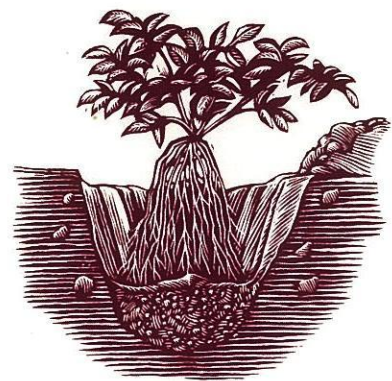
PLANT, BACKFILL AND WATER